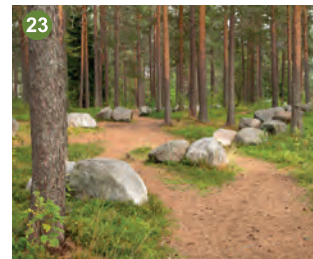
23 Richard Nonas 58 meter long double-line of double-borders, 1997