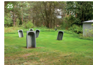
25 Carina Gunnars Untitled, 1994 Eight galvanized bathtubs