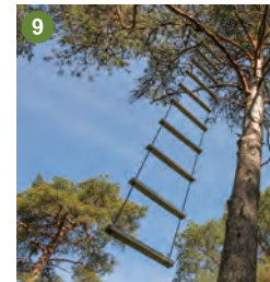
9 Johanna Ekström Ladder, 1998 Steel wire, aluminium h. 600 cm