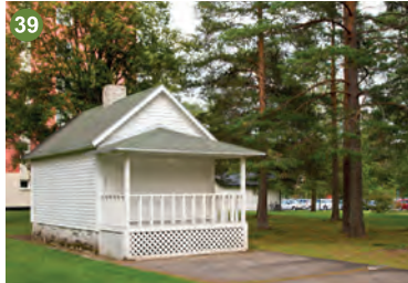
39 Clay Ketter Homestead, 2004 Wood, stone, cement, paint, lamp 500 x 820 x 390 cm