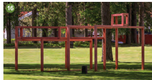
16 Mats Ljus Flip, 2006 Painted steel 235 x 350 x 370 cm