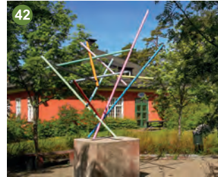
42 Jacob Dahlgren Den Sjuka Flickan, 2004 Painted Steel 325 x 210 x 300 cm