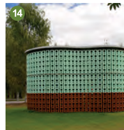
14 Winter & Hörbelt Kastenhaus 1166, 2000 Metal, wood and PVC