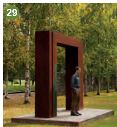
29 Sean Henry Trajan's Shadow, 2001 Bronze, oil, paint, steel arch 330 x 407 x 64 cm