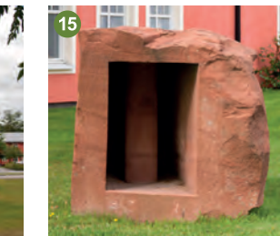
15 Anish Kapoor Pillar of light, 1991 Sandstone 150 x 140 x 200 cm