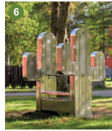
6 Jonas Kjellgren The most lonesome story ever told, 1998 Stainless steel 150 x 130 x 85 cm