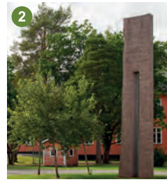
2 Bård Breivik Untitled, 2011 3 Granite works, h900cm