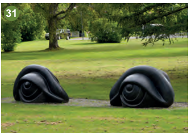
31 Louise Bourgeois Eye benches II, 1996-1997 Black Zimbabwe granite 122 x 196 x 118 cm