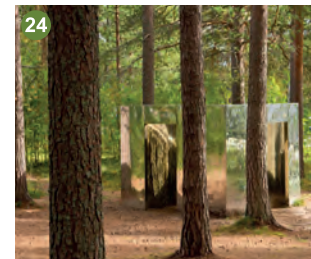
24 Cristina Iglesias Vegetation Room VII, 2000 13 resin and bronze powder panels 250 x 185 x 220 cm, 275 x 300 cm