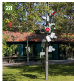
28 Bigert & Bergström Koma-Amok, 1997 Steel h 410 cm