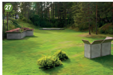
27 Mirosław Balka Concrete and leaves, 1996 30 x 60 x 10, 250 x 1958 x 795, 30 x 60 x 10, 250 x 521 x 174 cm