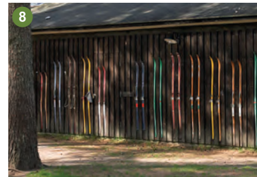
8 Raffael Reinsberg Social Meeting, 1997 Wooden skis 270 x 2500 cm