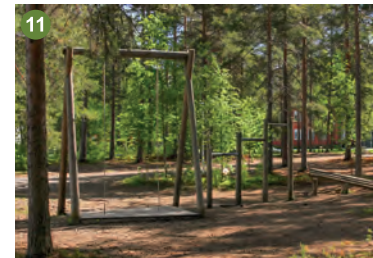
11 Torgny Nilsson Dysfunctional Outdoor Gym, 2004 Wood, metal, rope h. 4500 cm