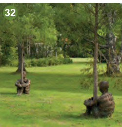
32 Jaume Plensa Heart of Trees, 2007 Bronze and trees 99 x 66 x 99 cm