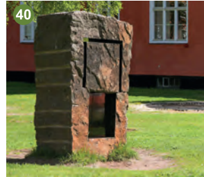
40 Takashi Naraha Structure 88-J-1, 1998 Green ekeröd granite 194 x 116 x 71 cm