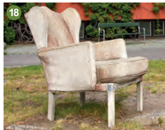
18 Nina Saunders Hardback, 2000 Concrete 90 x 60 x 100 cm