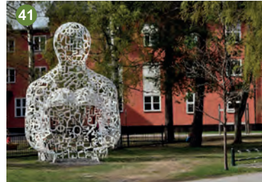
41 Jaume Plensa Nostros, 2008 Painted steel 500 x 360 x 340 cm