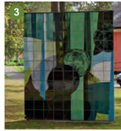
3 Astrid Sylwan Black, Grey, Broken Sky and Palest Blue, 2010 Ceramic tiles, steel structure 275 x 255 x 40 cm