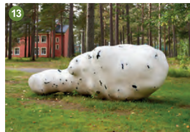
13 Wilhelm Mundt Trashstone 389, 2008 Production waste in polyester/fiberglass 110 x 303 x 112 cm