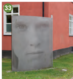
33 Anne-Karin Furunes Untitled, 2002 Stainless steel 260 x 224 cm