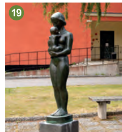
19 David Wretling Mor och barn, 1958 Bronze 115 x 25 x 30 cm