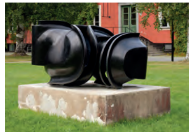
20 Tony Cragg Stevensson (Early Forms), 1999 Bronze 90 x 144 x 107 cm