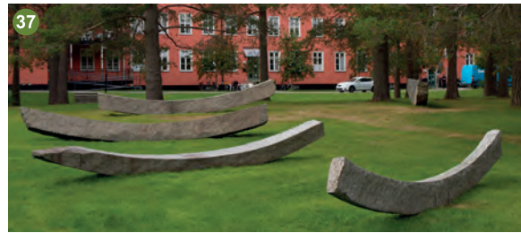
37 Clas Hake Arch, 1995 Grey granite Each bow between 555–610 cm