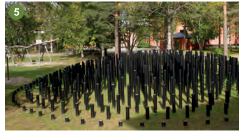
5 Buky Schwartz Forest Hill, 1997 Plastic pipes, concrete 200 x 1740 x 1740 cm