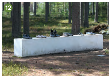
12 Roland Persson Untitled, 1998 Painted bronze, concrete 80 x 45 x 358 cm