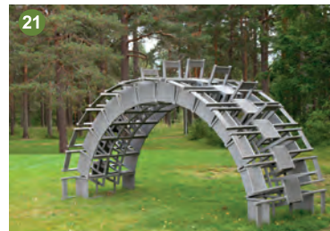
21 Kari Cavén Klassresa, 2008 Aluminium 225 x 154 x 378 cm