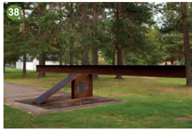
38 Cristos Gianakos Beam Walk, 1996 Steel 140 x 1000 x 300 cm