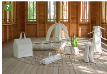
7 Gunilla Samberg Räddningsplats, 2008 Textile, grass, sunflower seeds 240 x 240 x 90 cm