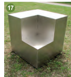
17 Cristos Gianakos Double Cross, 1999 Stainless steel 2 x (95 x 95 x 95 cm)