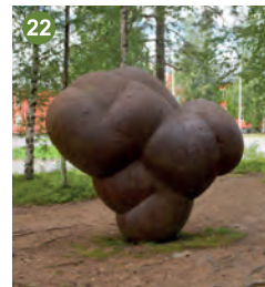
22 Antony Gormley Still Running, 1990-93 Cast iron 276 x 317 x 148 cm