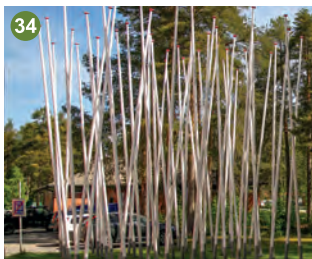
34 Kari Cavén Skogsdunge, 2002 49 flagpoles 9 x 7,2 x 7,2 m