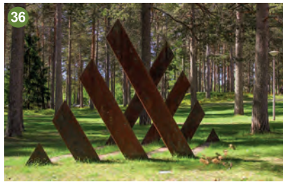
36 Bernard Kirschenbaum Untitled, 1993 Steel 277 x 315 x 315 cm