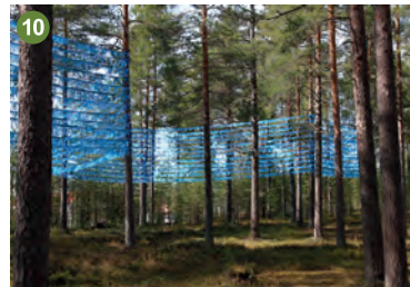
10 The Art Guys Love Song for Umeå, Banner work #7,2002 Metallic polyurethane plastic banners